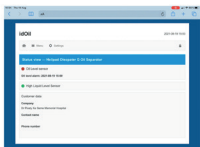
IPad Screen Grab of the interface with the Alarm System