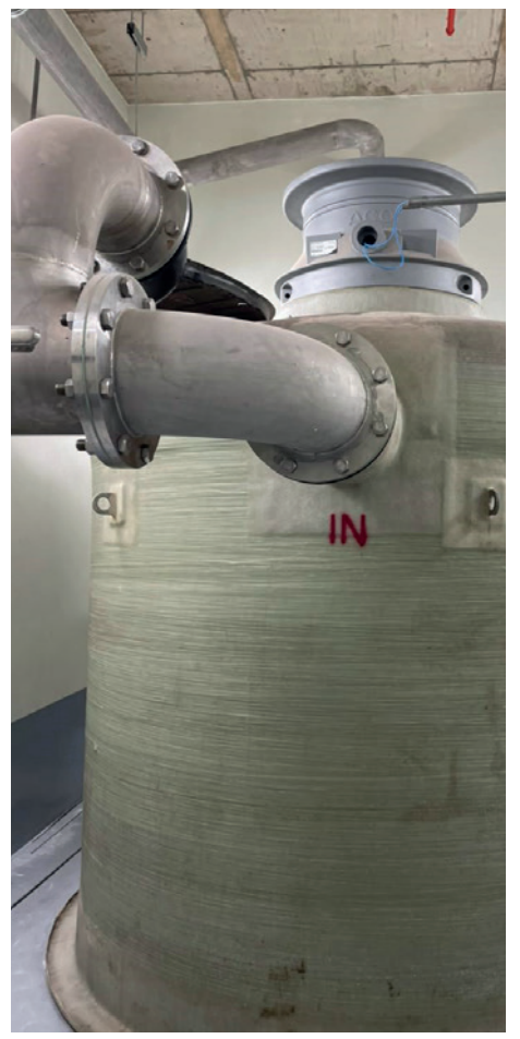
Oleopater G installed in the basement