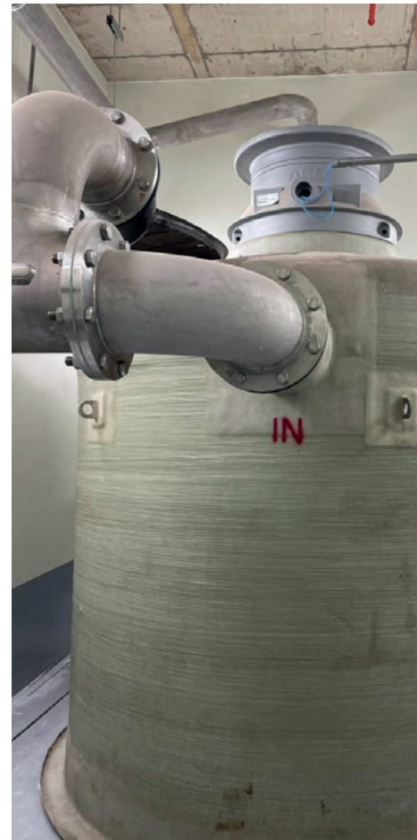
Oleopator G installed in the basement