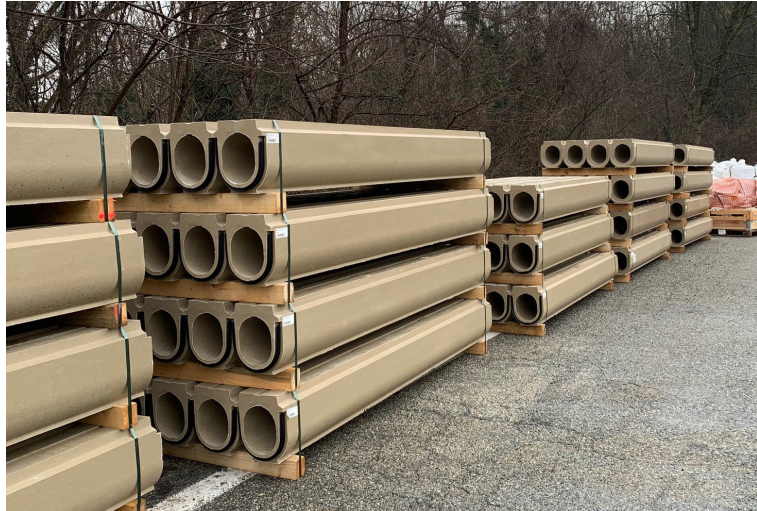
Above: stainless steel sump unit and Monoblock S channels near the Passo d'Avenco tunnel, waiting to be installed