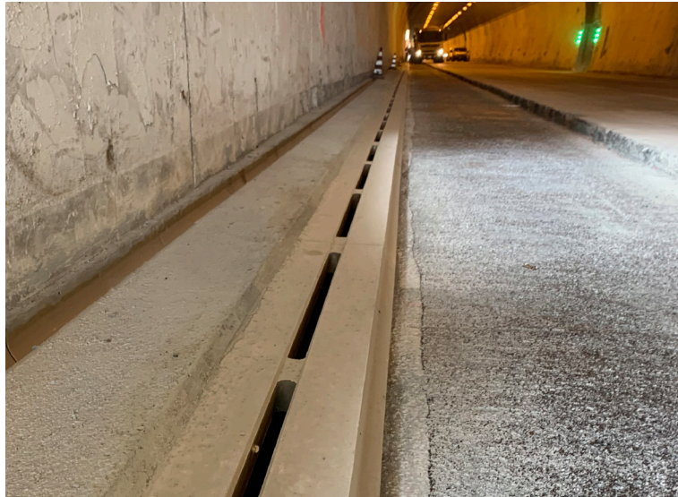
Above: ACO Monoblock S channels installed in Passo d'Avenco e Quassolo tunnels