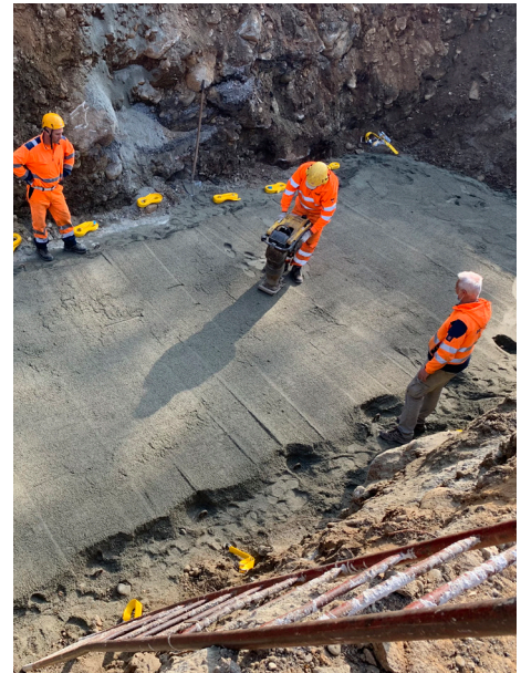
In these photos: ACO G-H tank installation phases